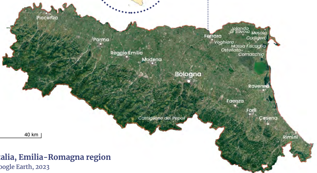
Italia, Emilia-Romagna region